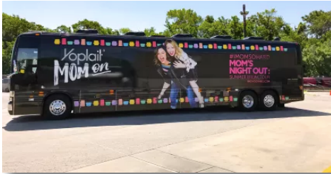
A pretty good sign that you've "Made It" is appearing in ads on the side of a bus.

The funny thing for me is that I have such terrible social anxiety, that being on stage in front of people doesn't register any higher than being at a dinner party. Nervous is pretty much my baseline. I get excited to be on stage, and my mantra has been the same for 20+ years of working in comedy clubs: These people paid their hard-earned money to be here, so work for it. We leave the stage exhausted and it's the best. We just want people to be happy to have been there.